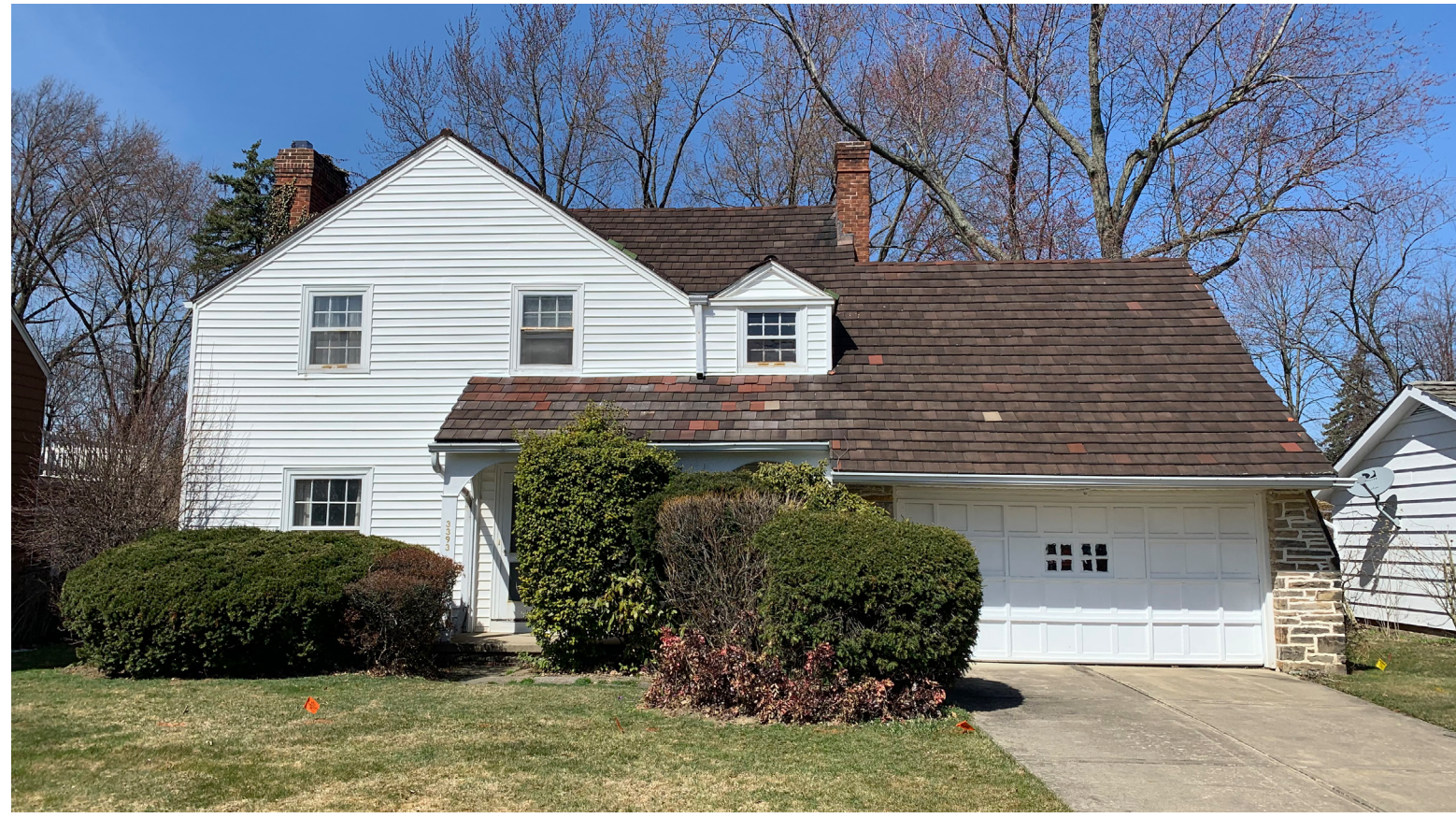
OPEN HOUSE: TUESDAY - APRIL 27, 2021 - 3:00-4:00 PM

Directions: From I-271 exit Cedar Rd. towards Beachwood to S. Belvoir Blvd., right then left on Mayfield Rd./US 322 W. then right on Forest Hill Blvd. & right on Seaton.